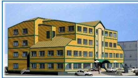
Δ ab ΓΔ c IV/ Inuksugait IV

ካዲኒዲኛ ሙዚቅ ካዲሮኒኦክሮማቲክ NCC, ከረድድኛ ስክልኒኒዲኒዮክሮማቲክ ለደረሰ ካዲሮኒኦክሮማቲክ ምድኛኒኒዮክሮማቲክ ረድድኛ ሮኒኒዮክሮማቲክ ከ (CanNor) ጋሮኒኒዮክሮማቲክ ሮኒኒዮክሮማቲክ ሮኒኒዮክሮማቲክ ለደረሰ ለደረሰኒኒዮክሮማቲክ ረድድኛ ምድኛኒኒዮክሮማቲክ ምድኛኒኒዮክሮማቲክ ምድኛኒኒዮክሮማቲክ