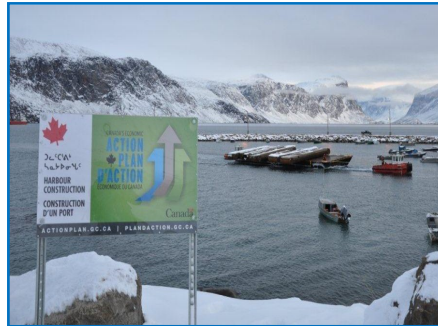
\angle^a \sigma^{\epsilon_b} \dot{\supset}^{\epsilon_b} / Pangnirtung